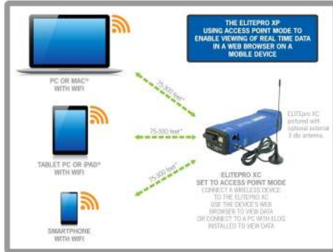
Access Point Mode using a web browser to interface with an ELITEpro XC with Wi-Fi.