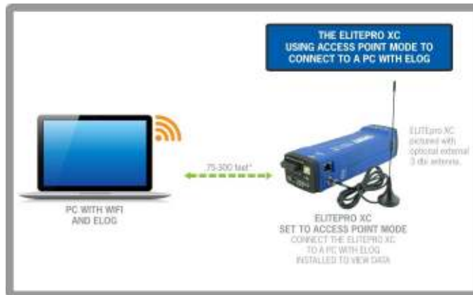
Access Point Mode using ELOG to interface with an ELITEpro XC with Wi-Fi.